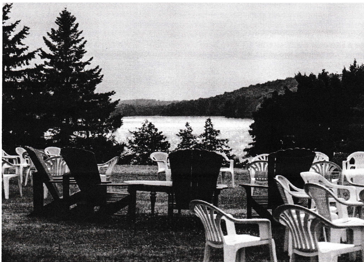
Tapas 2018: View across Sand Lake from Scheuermann Winery