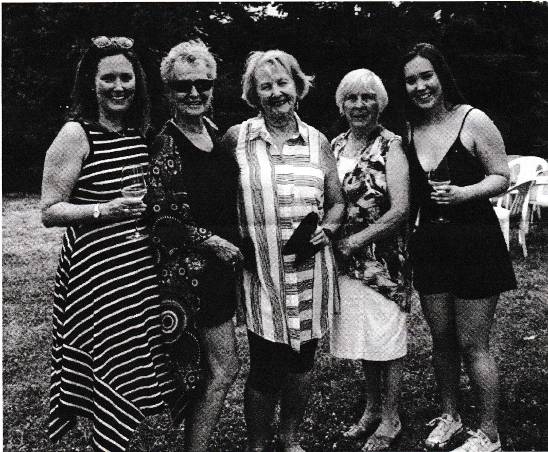
Tapas 2018: Happy campers

For more information about transportation subsidies, contact Rebecca at rebecca.whitman@rvca.ca or 613-273-3255.